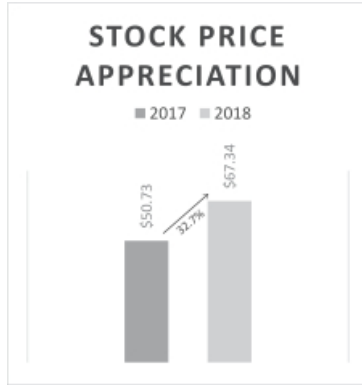
Year over year growth calculated based on the Corporation's stock price on the last trading day of each period

Our compensation decisions for 2018 were driven by our overarching goal of creating long-term stockholder value and linking pay with performance. While 2017 was a transitional year, in 2018, the Corporation delivered against its strategic priorities to enhance brand relevance, build momentum at Applebee's and IHOP, and return the Corporation to growth. 2018 performance was notably strong across several key metrics: