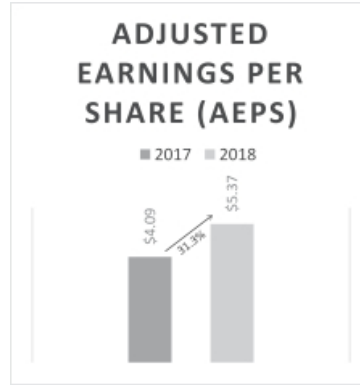
AEPS calculated as total adjusted net income available to common stockholders divided by weighted average diluted shares.

AEPS is a non-U.S. GAAP measure. Reconciliation of U.S. GAAP earnings per share to AEPS is provided in Appendix C