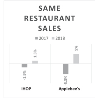
Percentage change in sales in 2018 compared to the same period of 2017 for domestic restaurants operated during both years and open for at least 18 months

AEPS is a non-U.S. GAAP measure. Reconciliation of U.S. GAAP earnings per share to AEPS is provided in Appendix C